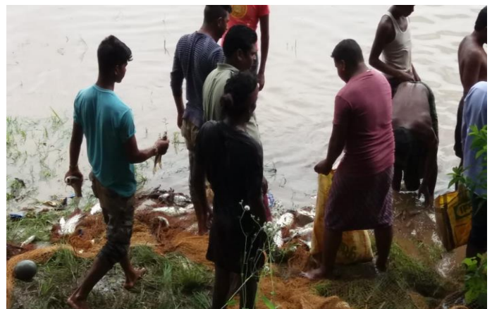
Pisci culture at Palsa- Kha village