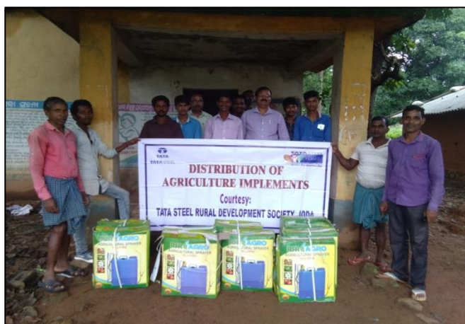
Distribution of agriculture implements at Jamunaposi

Paddy is the only crop produced in many villages of our periphery. We are promoting skill development of farmers through advance training. This training enhanced capacity building of famers. The main objective of this project is to enhance the agricultural yield of marginal farmers by improving method of rice cultivation and enhance their capacity through training and exposure. The farmers who got advance training will give field level training to other farmers Field levels helped farmers by giving greater insights of SRI cultivation. Total 112 farmers trained in fy 18-19.