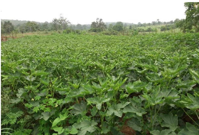
Vegetable cultivation at Jagarnathpur

Paddy is the only crop produced in many villages of ours periphery .We are implementing System of Rice Intensification (SRI) project in periphery villages. The entire project cost is Re 1.00 Lakh. In FY 18 – 19 we worked with 194 farmers in 125 acre of land in Nayagahrh, Brahmndih & Kotpals villages. The main objective of this project is to enhance the agricultural yield of small and marginal farmers by improving method of rice cultivation and enhance their capacity through training and exposure .The field level training of Farmers and farm visit were organised with support Govt. Agriculture Department. In addition to that we are supporting Palsa- Kha villagers for doing pisci- culture for income generation. The pond was constructed and being maintained by Tata steel .