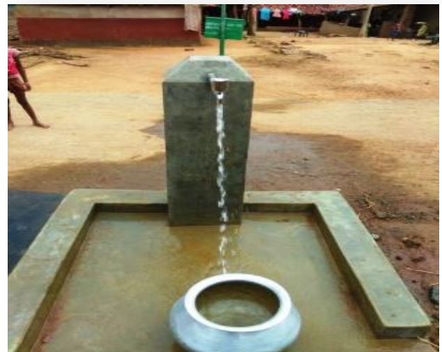
Solar power drinking water project at Kamalpur and Bandhuabeda village

Community people and key stakeholders have requested us for provide drinking water facility in Kamalpur and Bandhuabeda village. The villagers have problem of drinking water especially in summer season. They used water form Baitarni River. It was half kilometer from village.