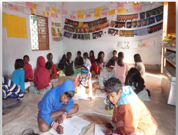
Work sheet activity