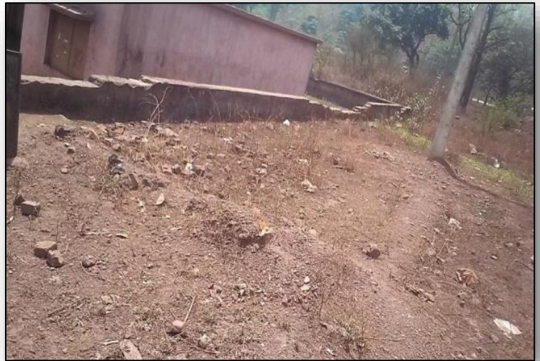
Old boundary wall of Joribar School

Joribahal Primary School caters education of children in and around Joribahal village. The school is running in the periphery of Tiring Pahar Mn. Mines where about 106 students, out of which 86 SC/ST students are presently studying from class I to Class V. At present there is a broken and dysfunctional boundary wall around the school and no entrance gate at all. Being a primary school specially the school should have a proper