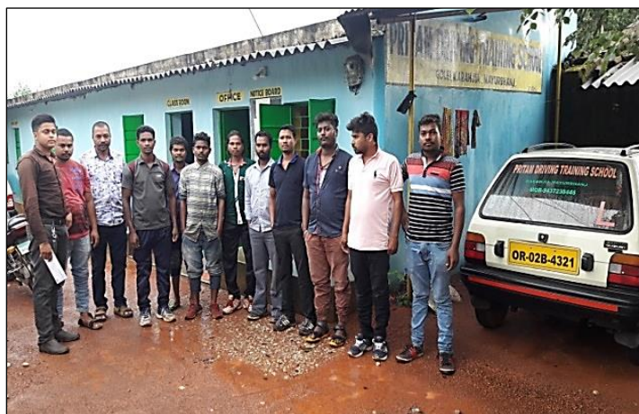
Youths at the Driving Training Institute

One month residential training was provided by the Institute which is affiliated with State Transport Authority, Odisha. It has all basic infrastructures like classroom, Light vehicles, Heavy vehicles and training ground. The Institute gives a 30 days training to the candidates which gets verified by HMV Inspector and further Final Driving License is issued to the successful candidates. A total 8 nos of unemployed youth from operational villages of Khondbondh, FAP and OMQ area were provided training in the 1 st batch from 20 th Sept'18 to 20 th Oct'18 . These youths have received a Driving License, Training completion Certificate and Accidental Insurance of Rs. 1.0 Lakh. 15 nos more youths has already been screened for 2 nd batch and expected to start the training from January'19.