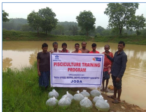
Farmers Training on Pisciculture at Jamunaposi