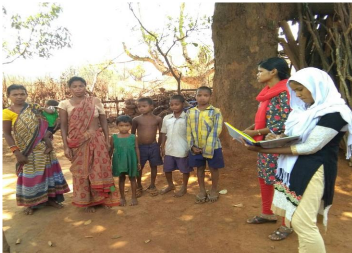
Door to door motivation for absent children

In order to ensure that no child remains out of school through direct enrollment or bridge courses, a school enrollment drive was undertaken to ensure all children in the age group of 6-8 years are enrolled in school. Similarly, to address learning gap of never-enrolled and school drop-outs in age group of 9- 14 years, a 6 to 12-month course to bridge the learning gap was imparted through RESIDENTIAL BRIDGE COURSE (RBC). It sought to address longer period of learning deficits among children.