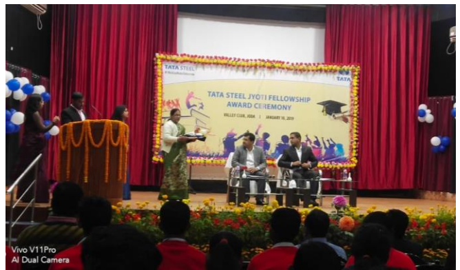
JYOTI FELLOWSHIP AWARD CEREMONY