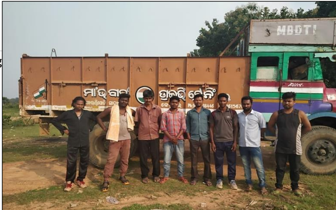
During Practice Session at the Ground