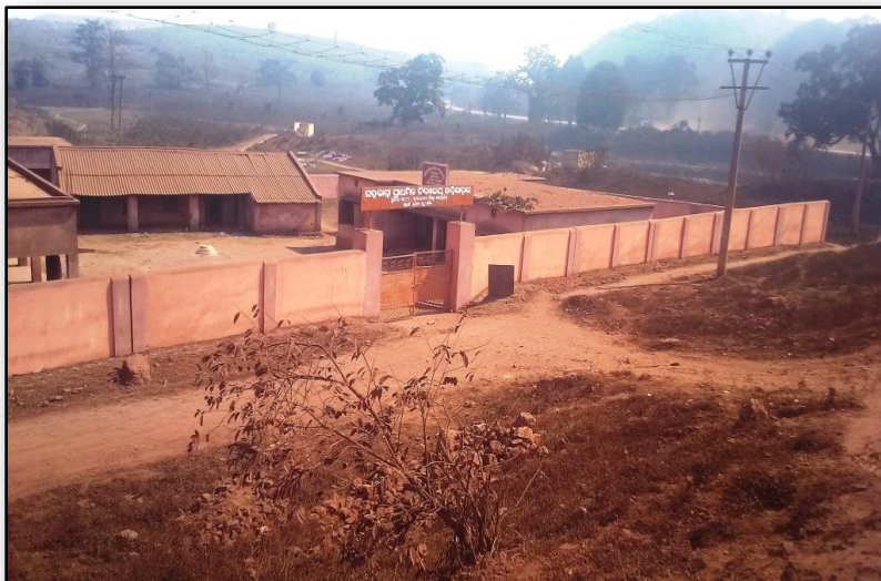
Construction School boundary wall at Joribar

boundary and a sturdy entrance gate to ensure that the children are safe inside the school. Therefore, a school boundary wall is required to be constructed & height extension for safety of the student. And the same has been requested from the Head Master of the school. We constructed & heightened school boundary wall, also inside-outside plaster, painting done & gate made. After construction, the school's ambiance was improved and all students were able to study safely.