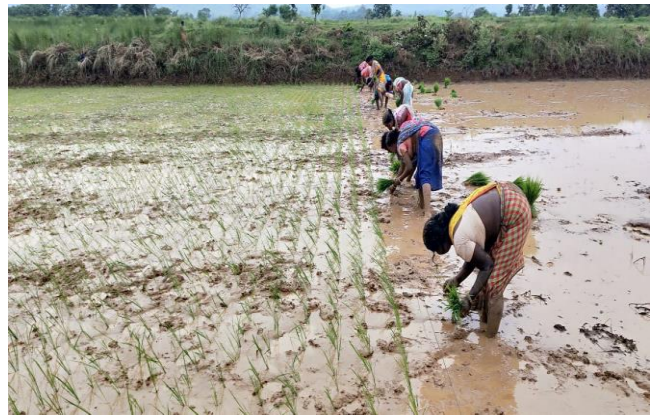
Paddy cultivation through SRI Method at Jagarnathpur

Agriculture generates livelihood not only in direct form but also in indirect form to many landless peasants. As paddy is the only crop raised in many villages of our periphery, we are geared towards supporting the farmers by providing training and technical guidance.