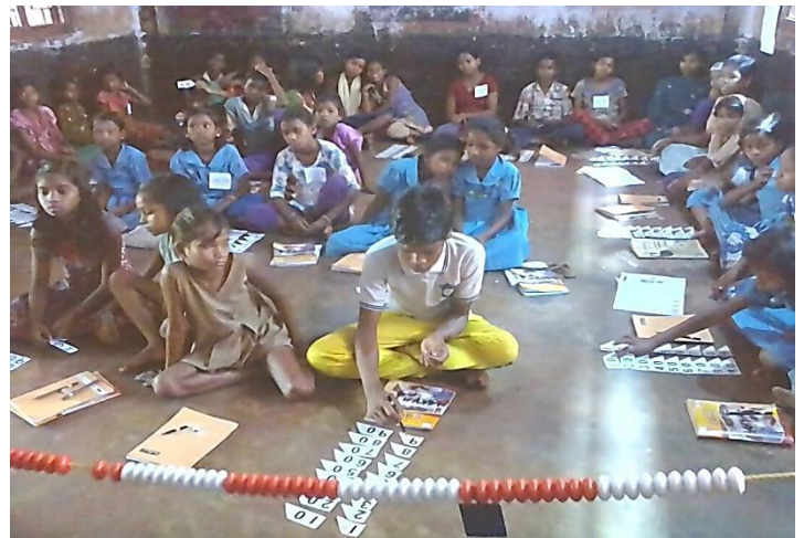
Ganitmala clip-4 activity in summer camp Kamarjoda UGUPS, Joda

The overall goal of the project is to make Schools Right to Education (RTE) compliant in selected tribal districts of Odisha. It has three core objectives and intends to achieve the same in given time frame. They include, improving access to school for children, improving quality of education and improving governance of schools.