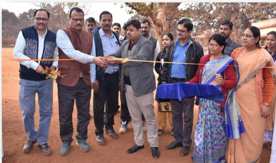
Inauguration of Mega Health Camp at SSVN, Bamebari

Besides these, specialized health camps are organized on time to time basis at different remote tribal villages to make them avail free health diagnosis and treatment.