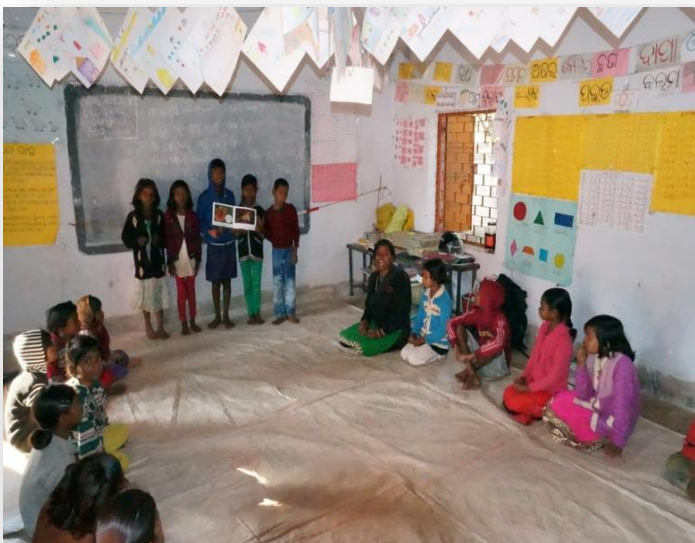
Group Presentation with Scholastic book