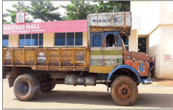
During Final License Test Drive at Bhubaneswar

Presently, these youth are practicing on Light Motor Vehicles and earning about Rs. 8000/month. After receiving HMV license more opportunities will knock their door and they would earn about Rs. 18000/month.