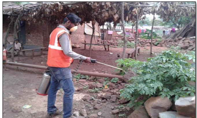
Fogging at Joribahal village