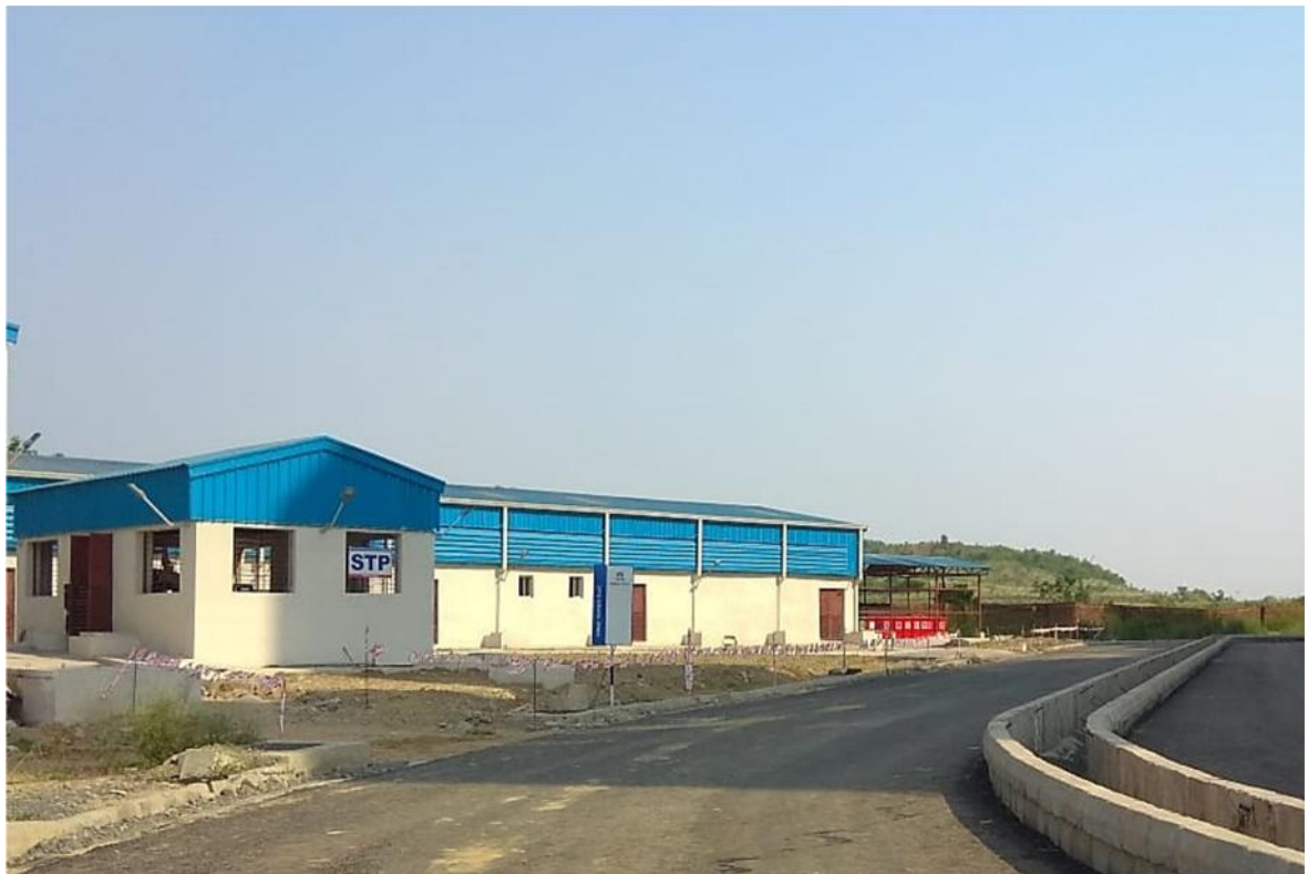
Sewage Treatment Plant Facility at Residential Complex