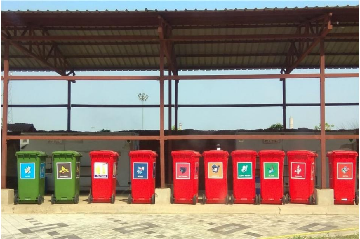
Colour Coded Bins for Waste Segregation at Site