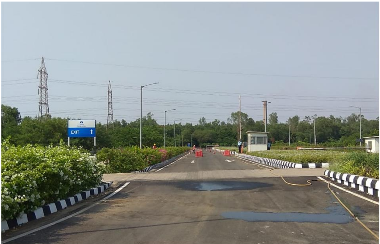
Separate Exit road