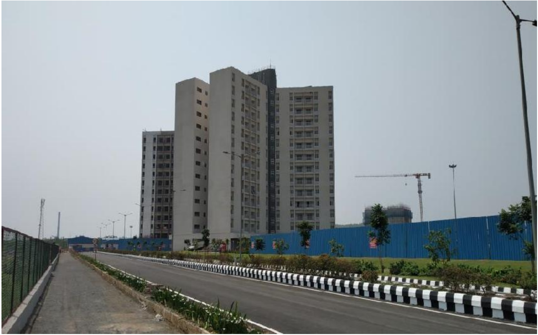
View of Residential Complex