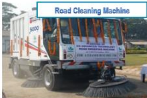
Road Cleaning Machine