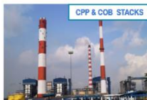
CPP & COB STACKS