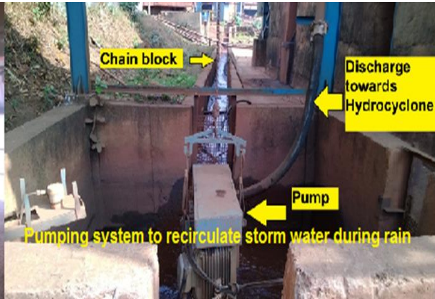
Tailing Dewatering Plant and Water Recirculation Arrangement