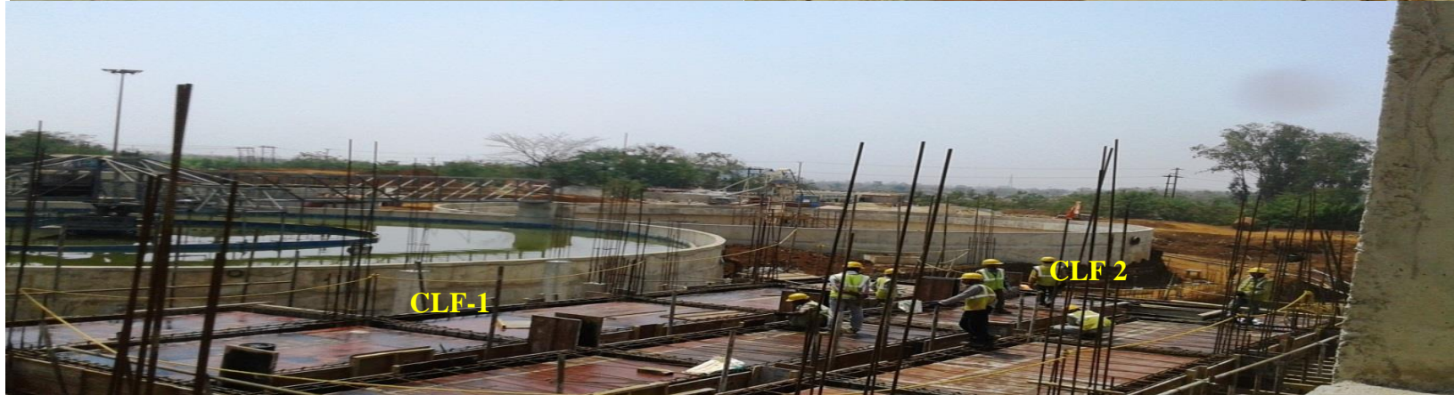
Clariflocculator of New ETP