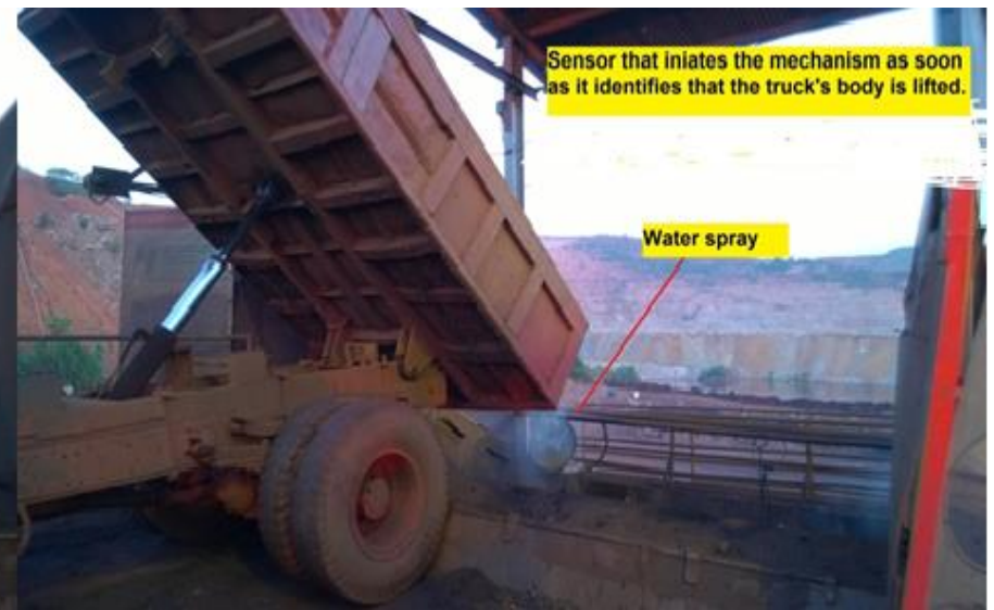
Dust Suppression System at Hopper