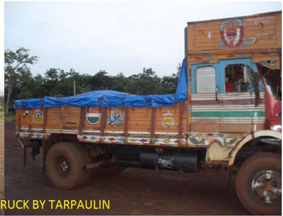
COVERING OF TRUCK BY TARPAULIN