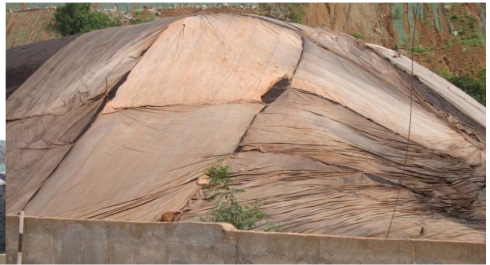
Concentrate Stack Covered With Tarpaulin