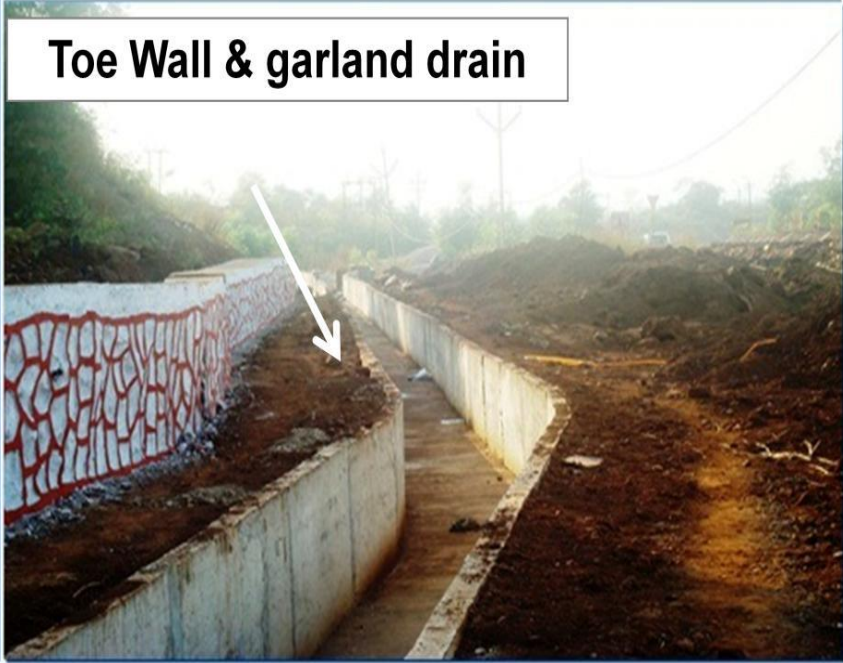
Toe Wall & garland drain