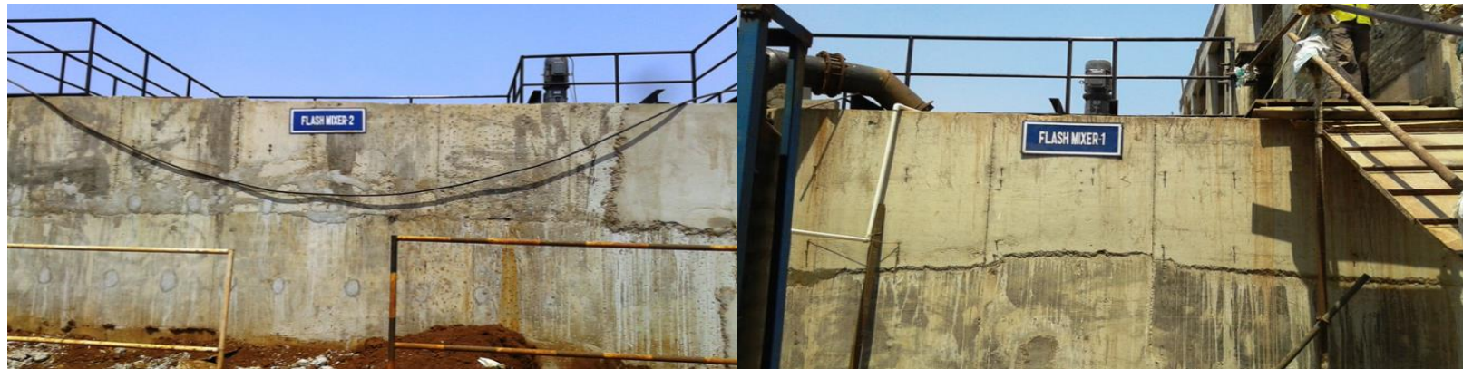
flash Mix Chamber