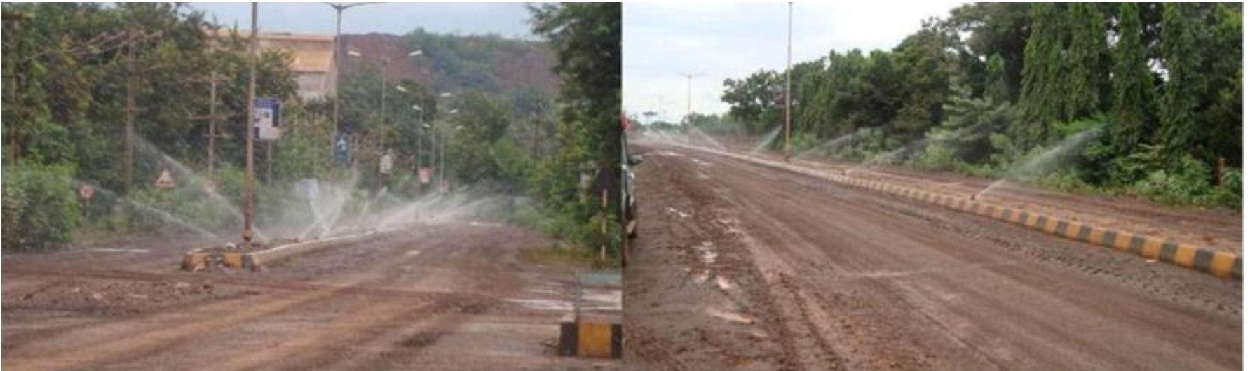
Stationary Water Sprinkler