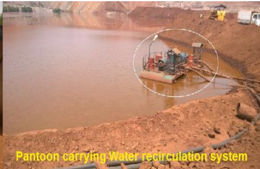
Thickener and Water Recirculation Arrangement