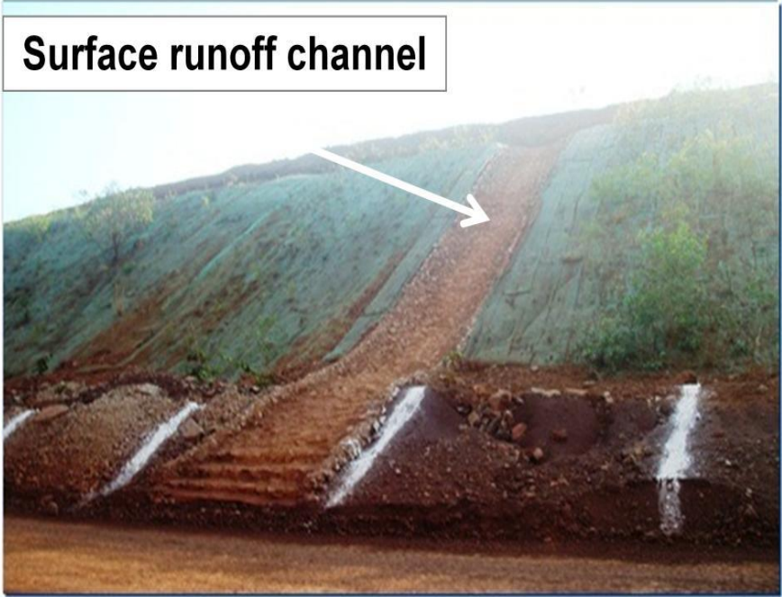
Surface runoff channel