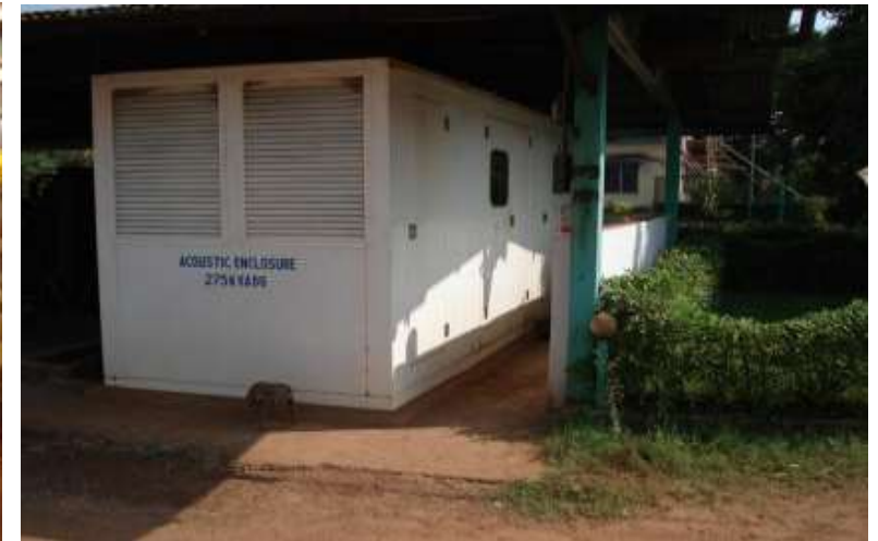
Acoustic enclosure for DG set