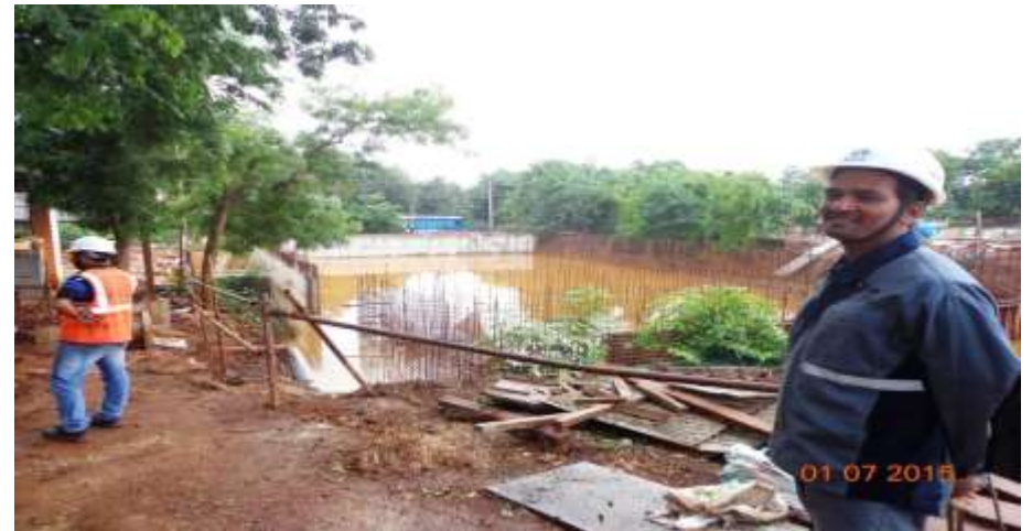
Raw Water Collection Tank at N-E side