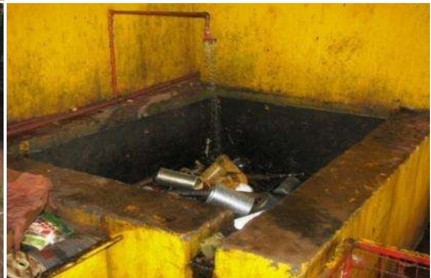
Oil and grease Separation pit