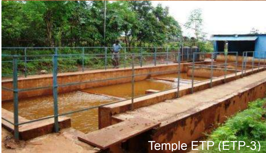
Temple ETP (ETP-3)