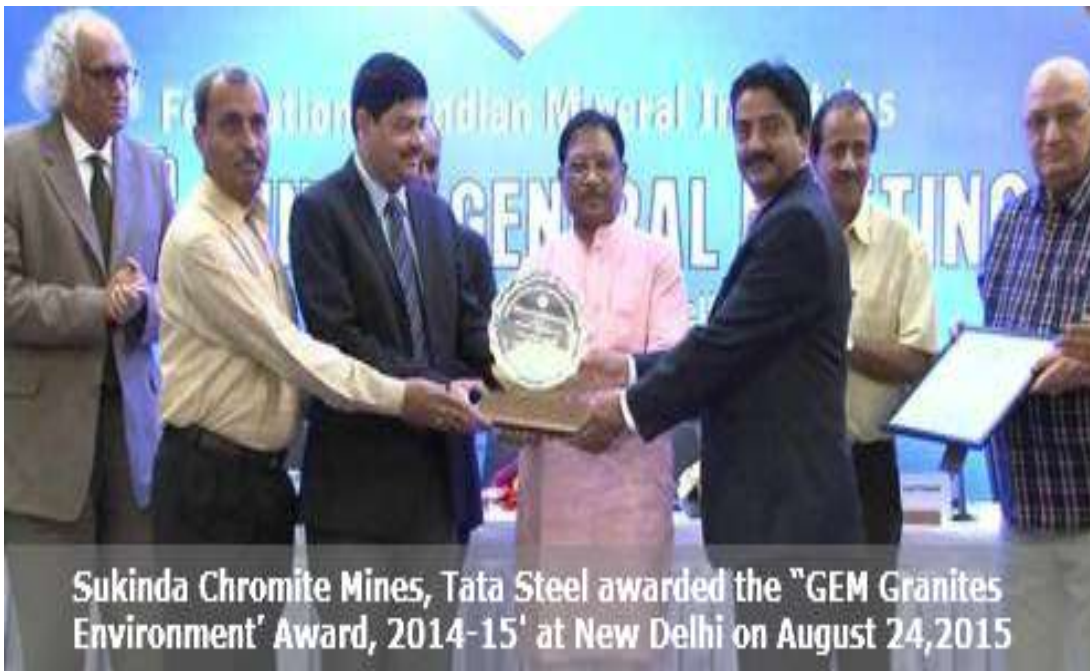
Sukinda Chromite Mines, Tata Steel awarded the "GEM Granites Environment' Award, 2014-15' at New Delhi on August 24, 2015