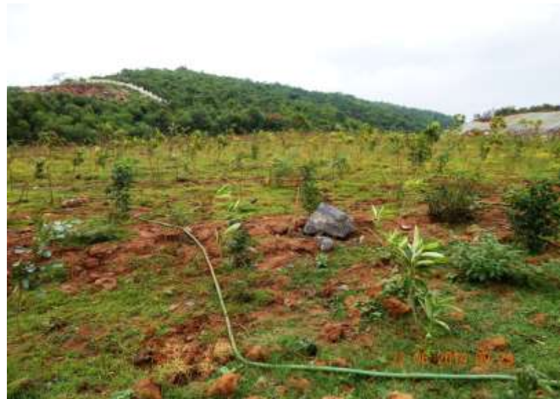
Plantation over dump