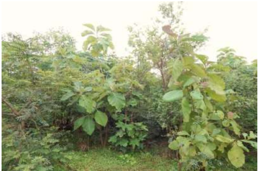
Significant growth in Plantation at Demonstration Plot.