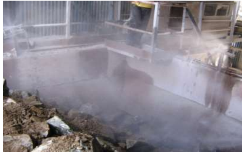
Photograph showing high pressure water spray nozzles at feed hopper