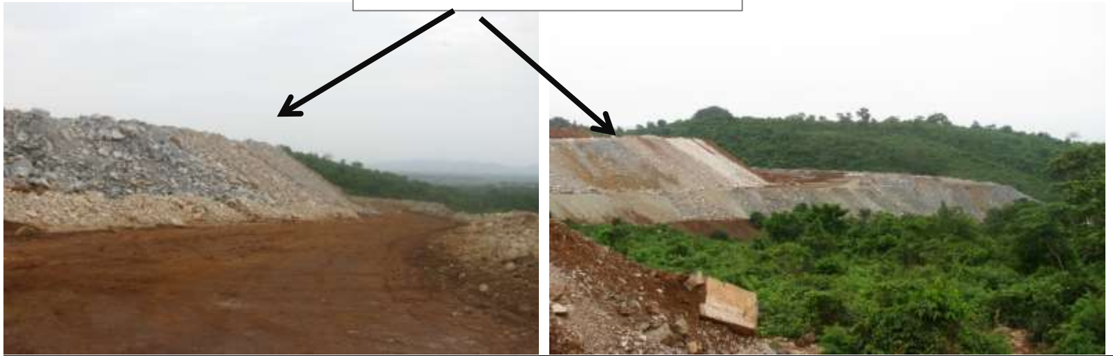
Rocky material on running dump slope