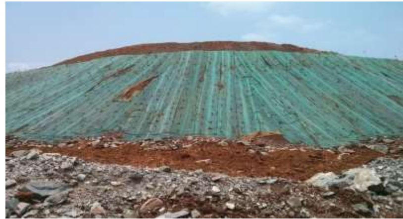
Coir matting over dump