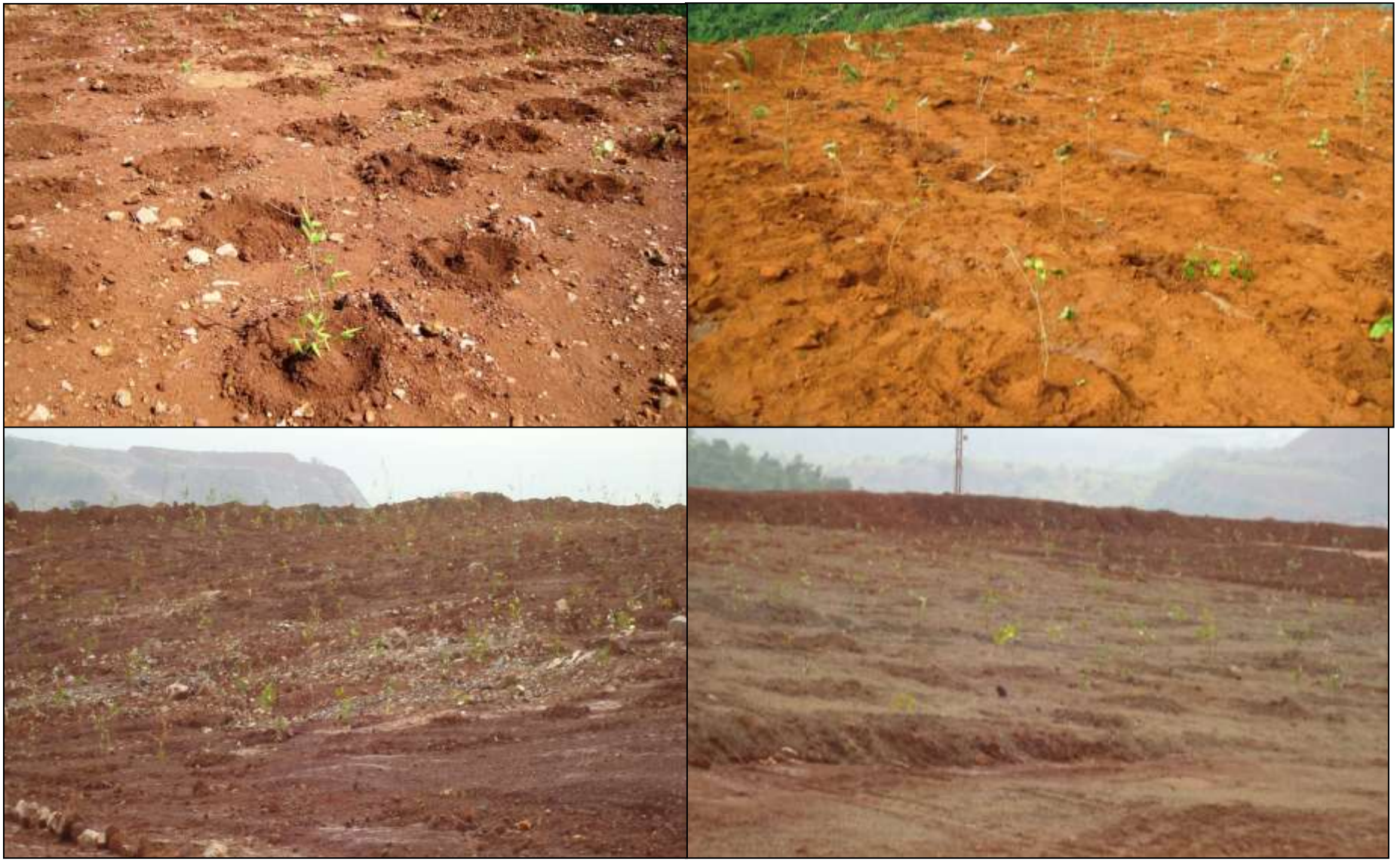
Inwardly slope dump top