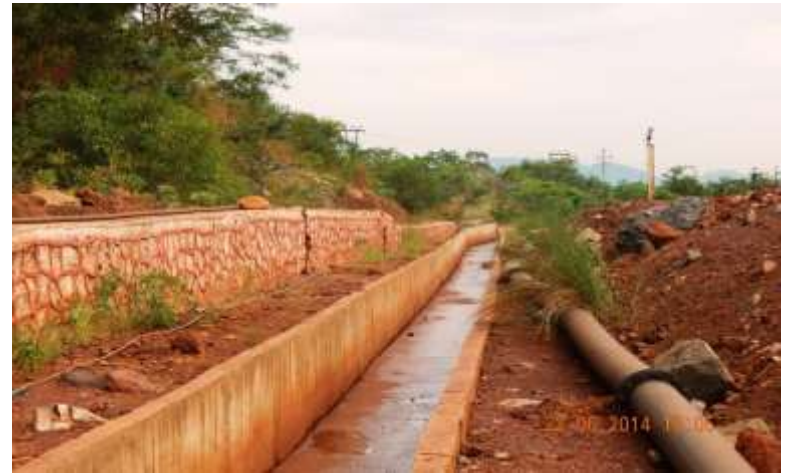
Garland drain concrete culvert