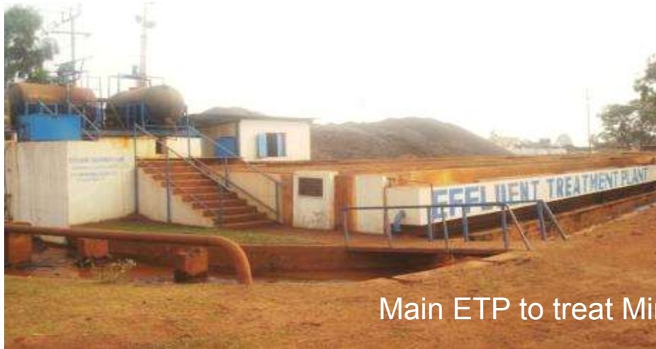
Main ETP to treat Mine discharge (ETP-1)