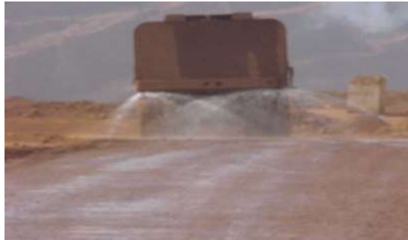
Photograph showing Dust suppression using Stationary as well as Mobile water sprinklers