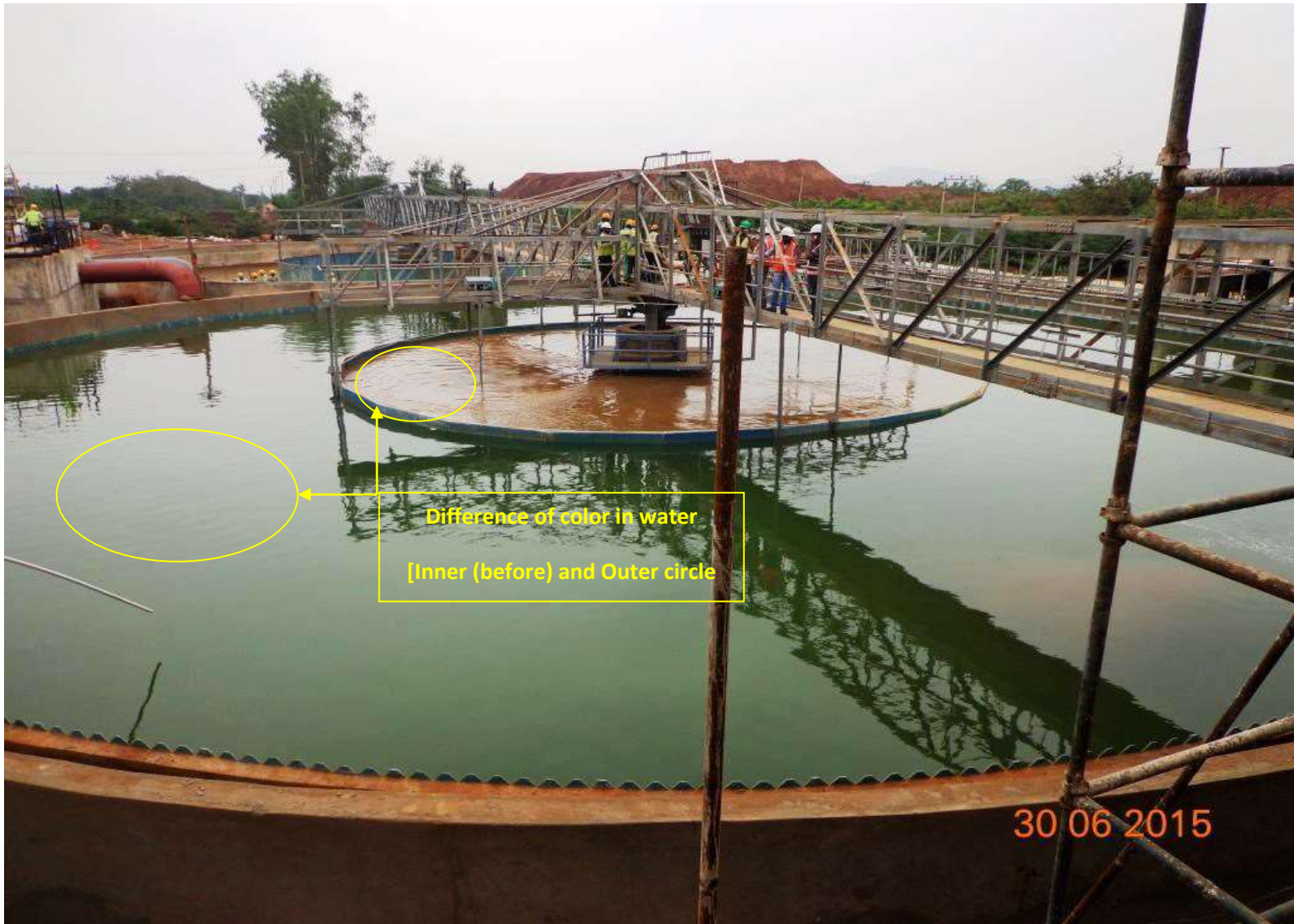
New ETP CLF-1 in operation