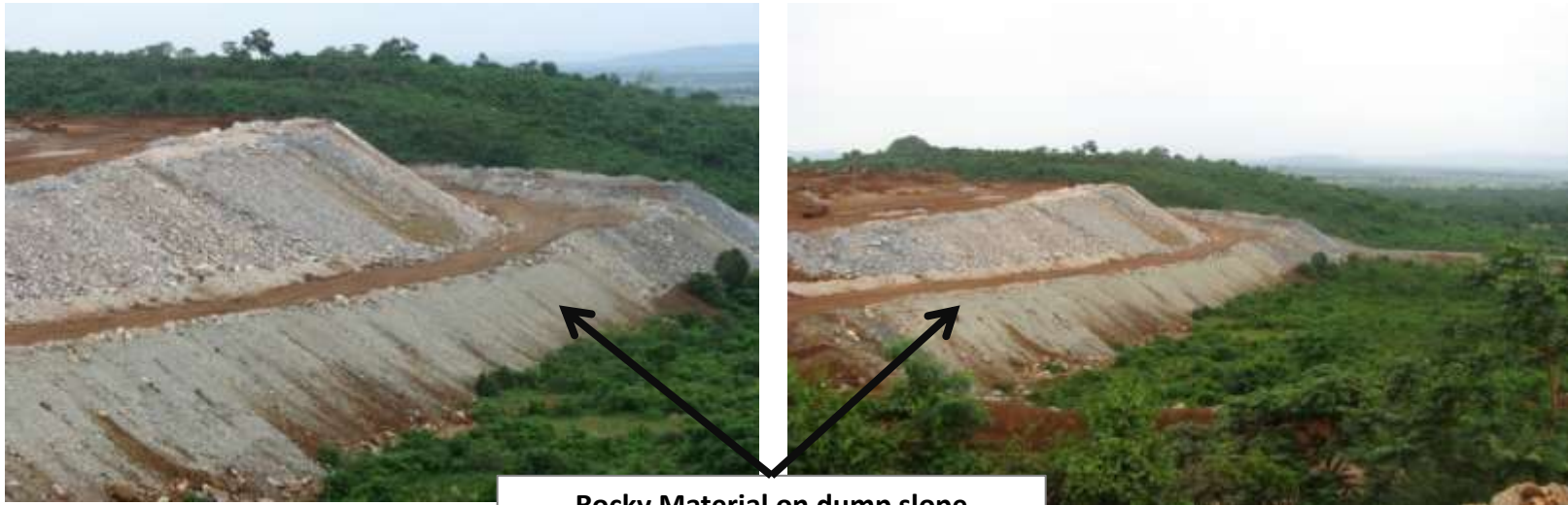
Rocky Material on dump slope