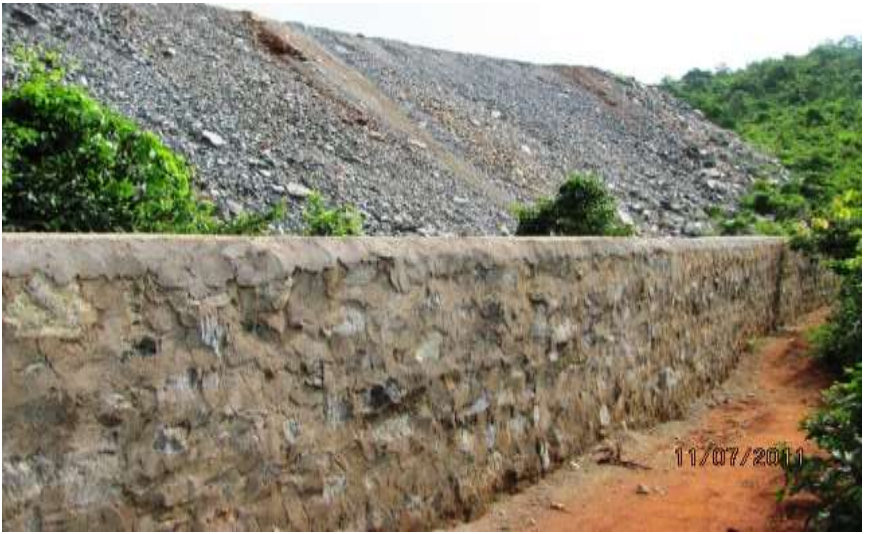
Toe wall along the dump