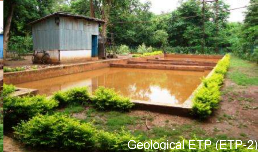
Geological ETP (ETP-2)

Cr+6 TREATMENTS: Mine water & surface runoff