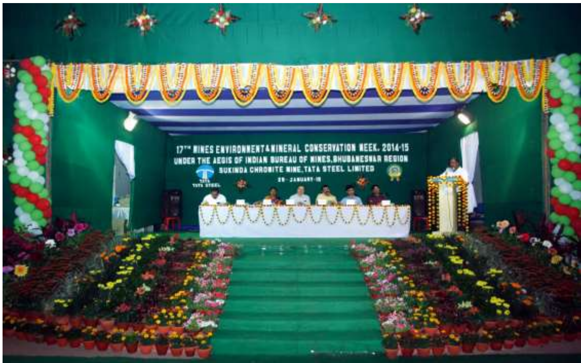
MEMC Week celebration