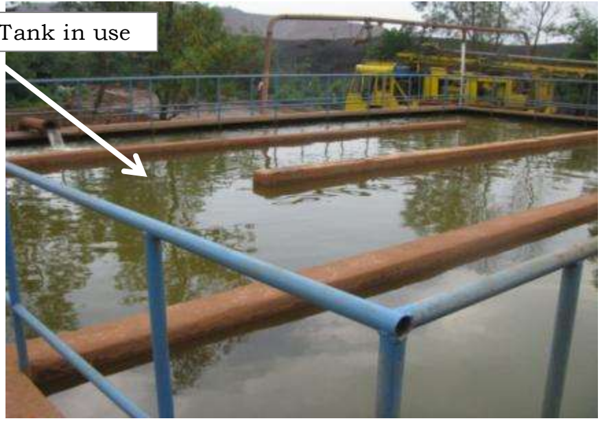
One Settling Tank in use