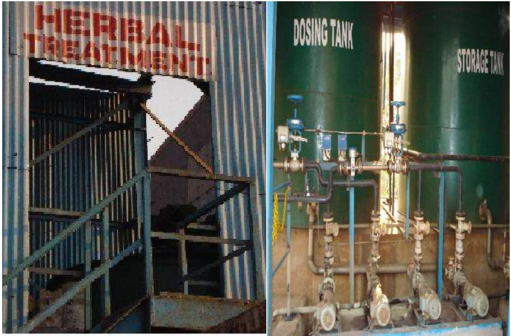
Herbal Treatment Plant