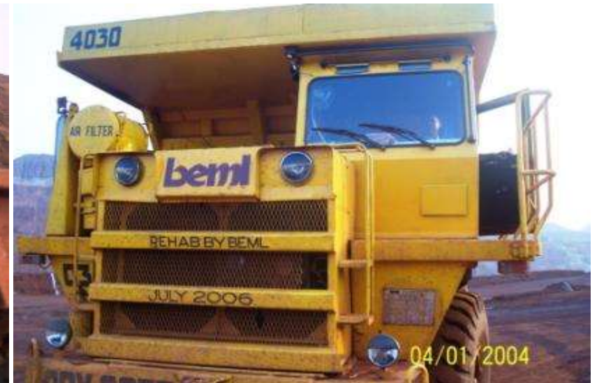
Air tight air conditioned cabin in HEMM