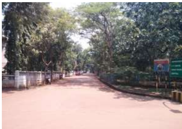
Between Workshop and Colony