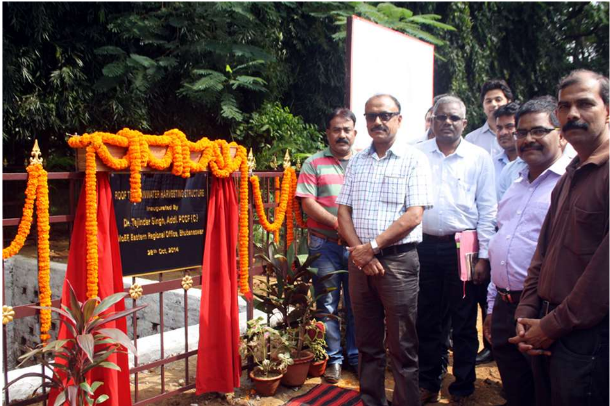
Inauguration of roof top rain water harvesting system at Administrative office.