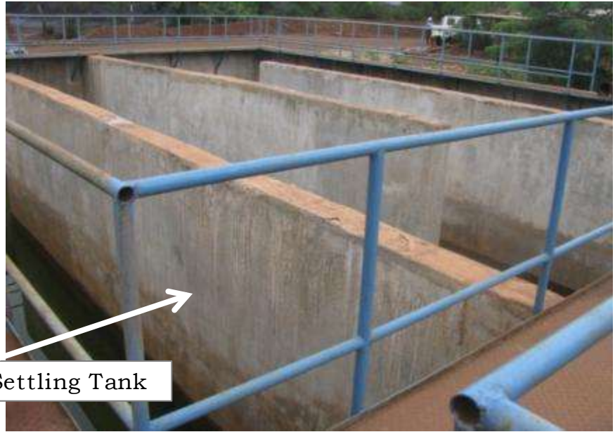
One Standby Settling Tank