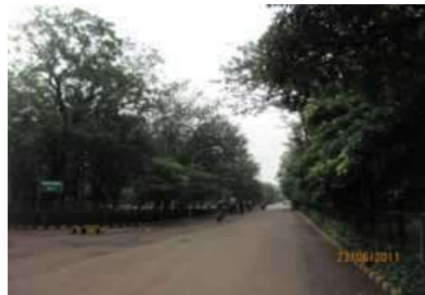
Along Northern Boundary of Lease