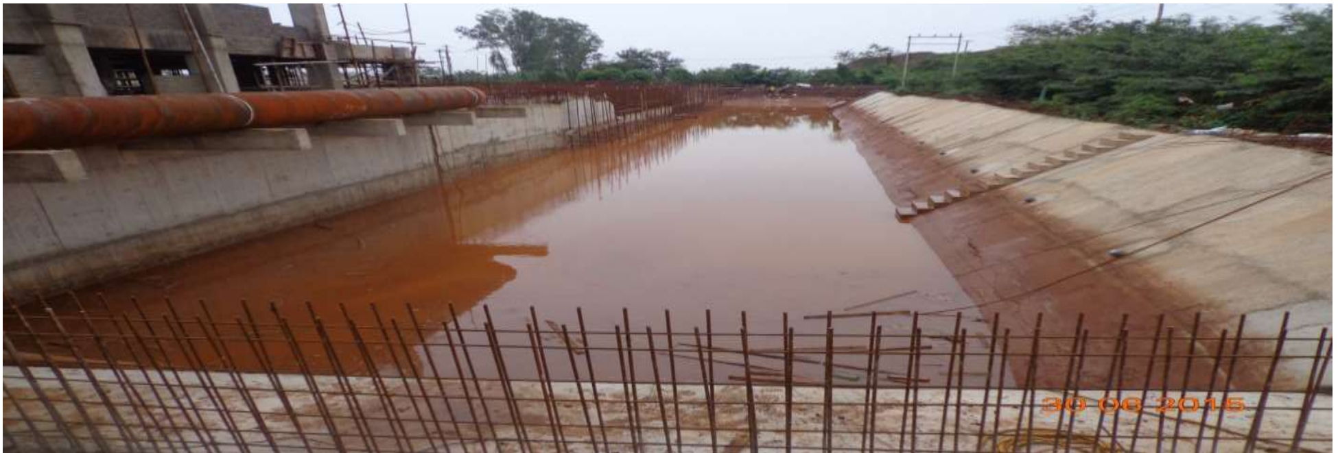
Raw water collection tank at S-W side of Lease