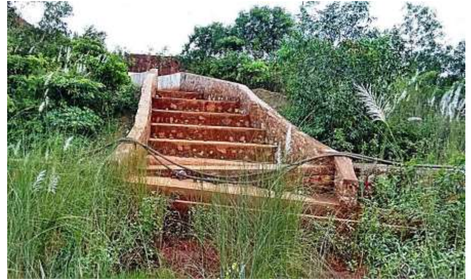
Drainage System (Concrete Channel)