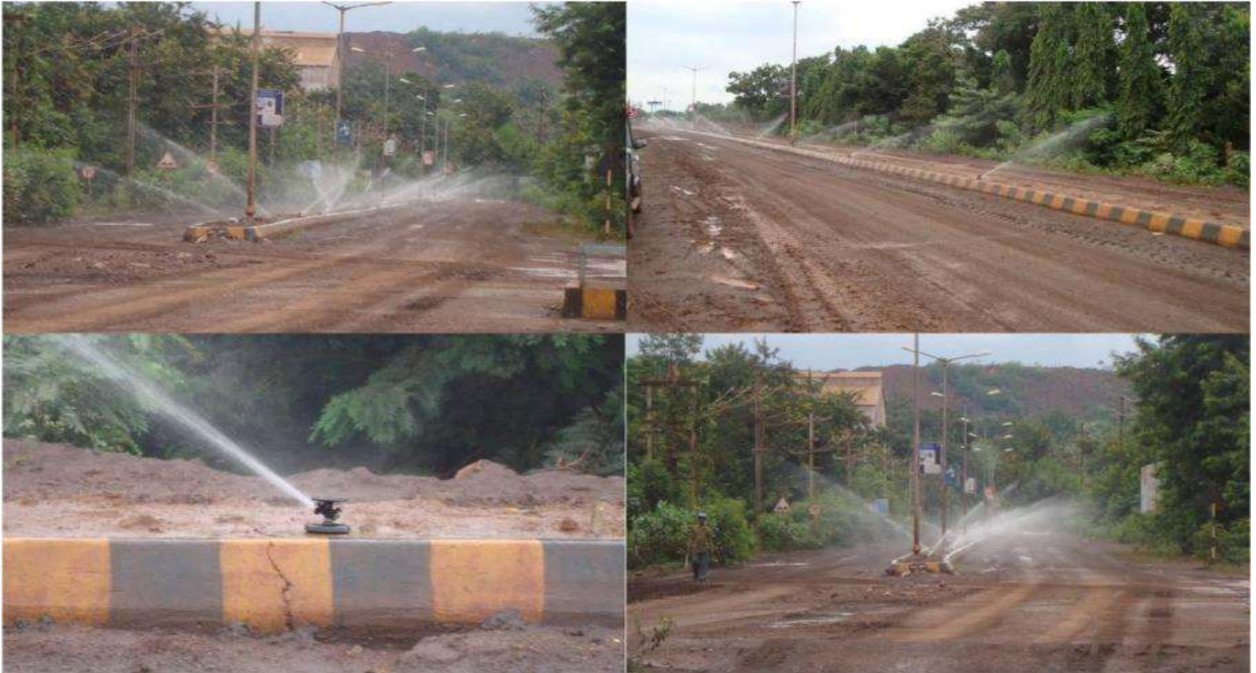
Stationary Water Sprinkling System