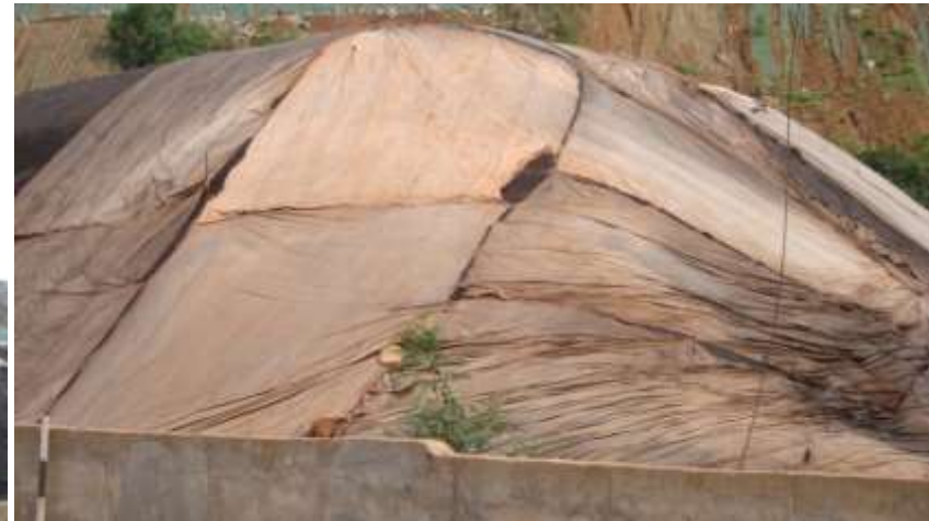
Photograph showing concentrates is covered with tarpaulins