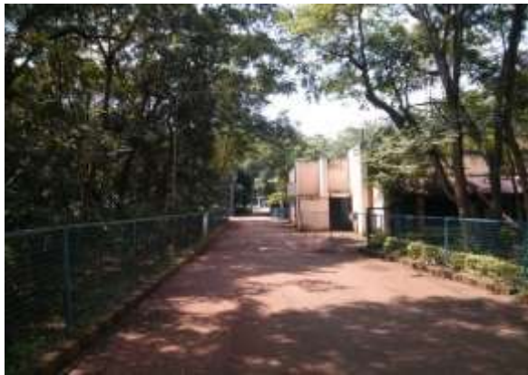
Near Mine Office