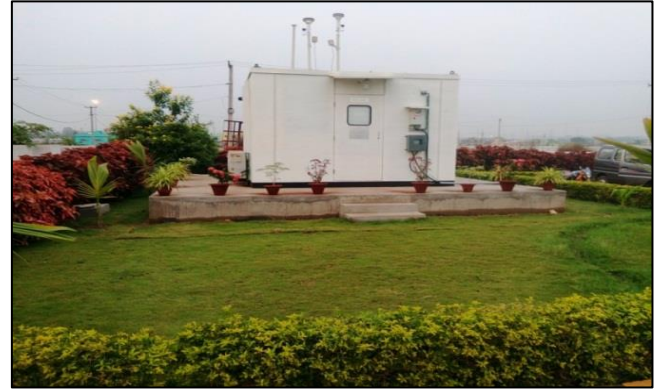
CAAQMS outside plant