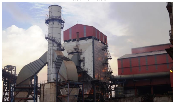
Blast Furnace Cast House ESP