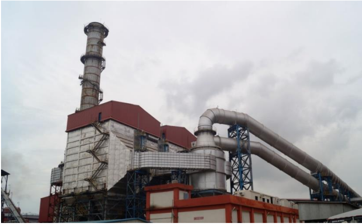
Secondary Emission Control System of Steel Melting Shop