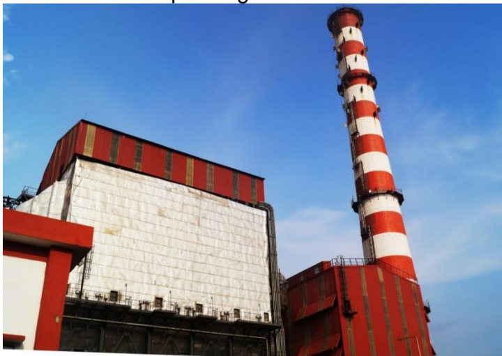
Waste Gas ESP of Sinter Plant