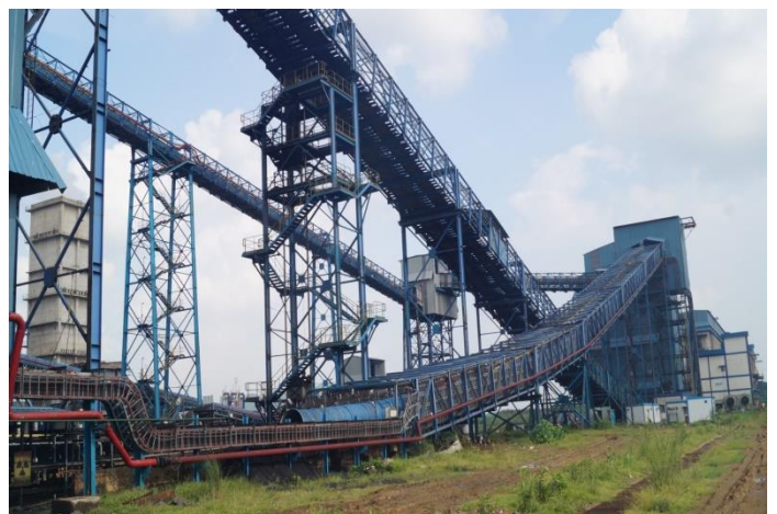
Raw Material Conveyor belt