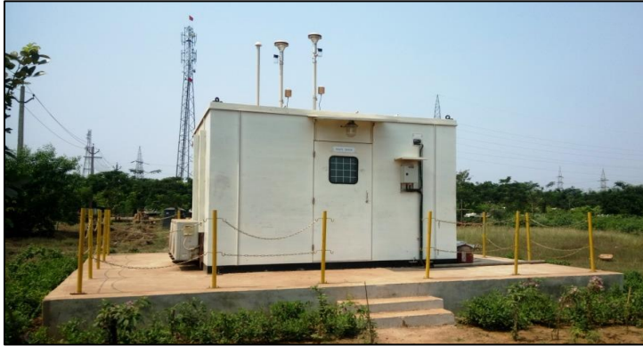
CAAQMS inside plant