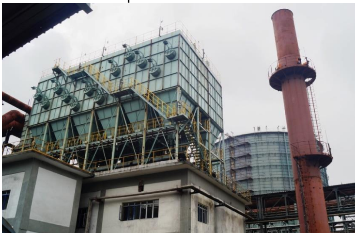
Bag Filter for Coke Ovens