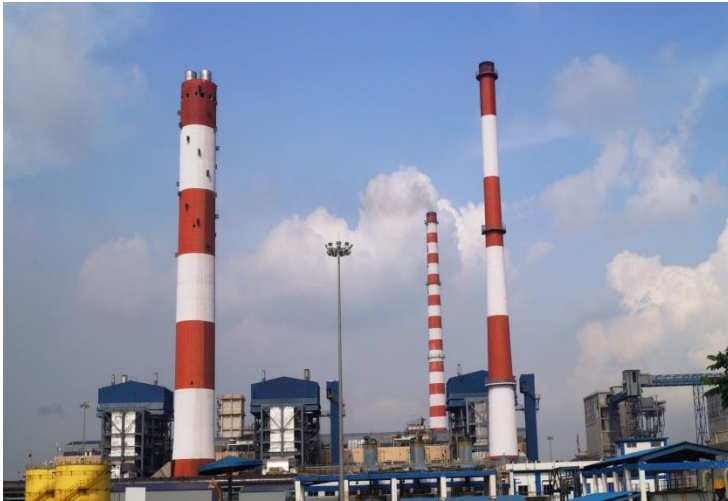
Captive Power Plant