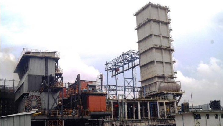
Coke oven battery with stamping, charging cum pushing machine