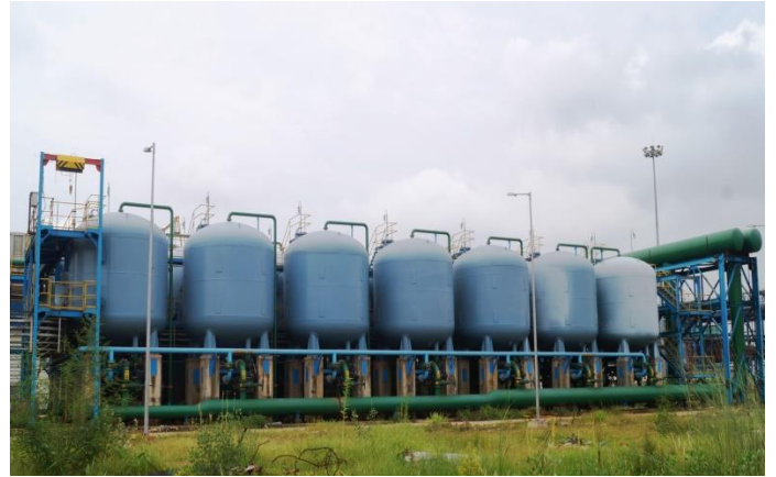
Water Filtration System at Hot Strip Mill