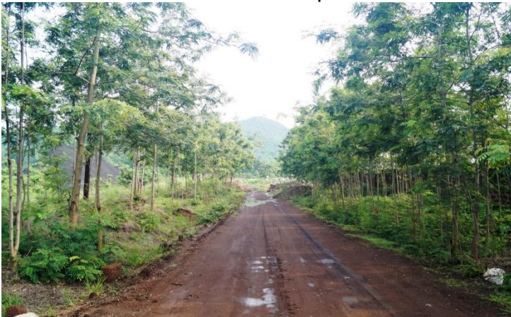
Plantation inside plant premises