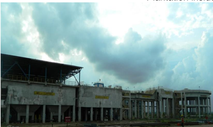
Raw Water Treatment Plant