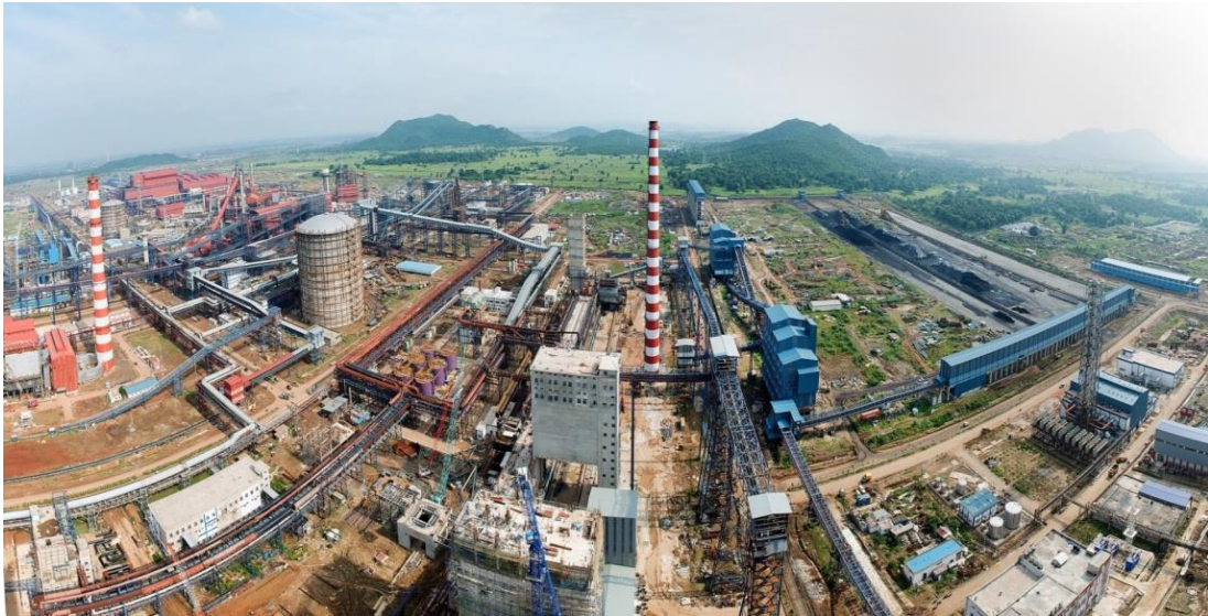
Aerial View of Tata Steel Kalinganagar