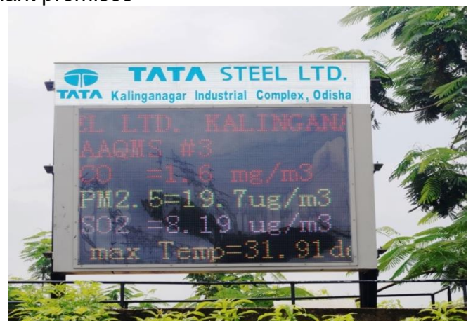
Digital Display of Environmental Information at Main gate