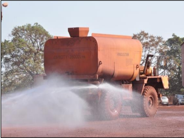
Mobile Water Sprinkler