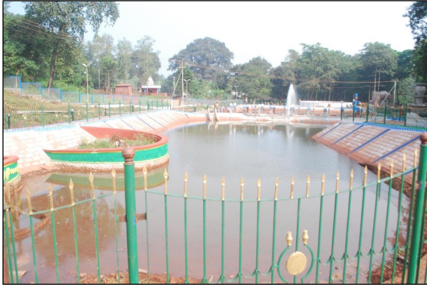
RWH at Balijore camp