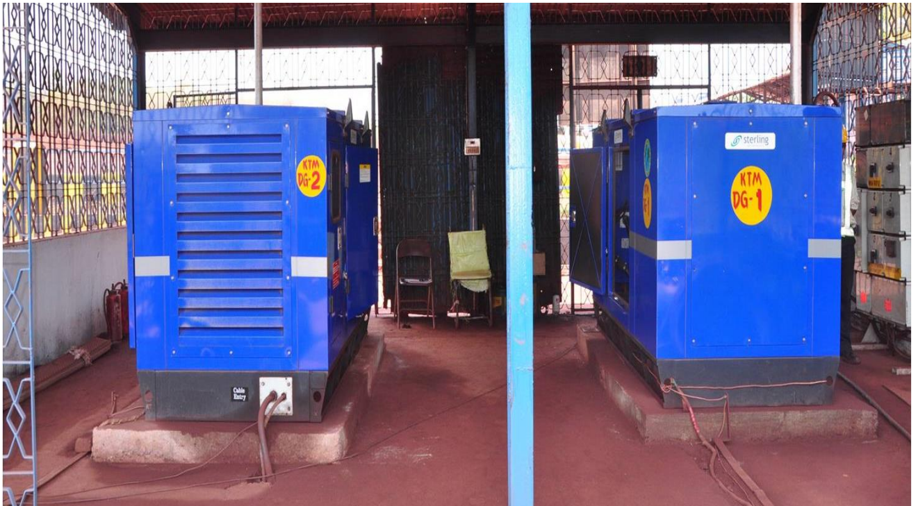
Acoustic Enclosures of DG sets