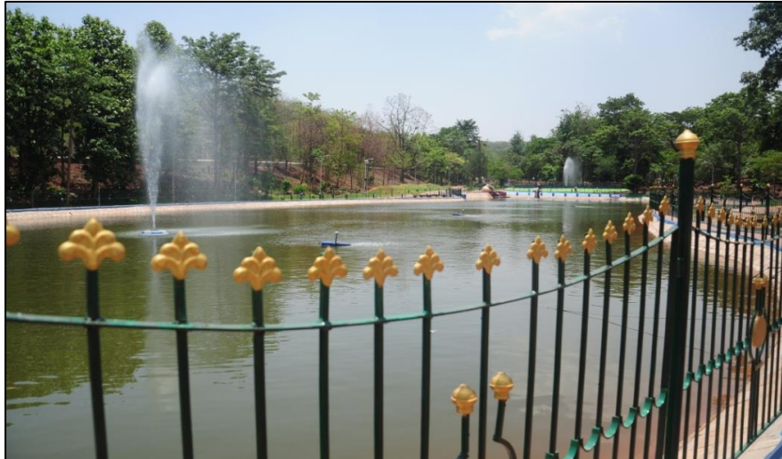
RWH at Central camp