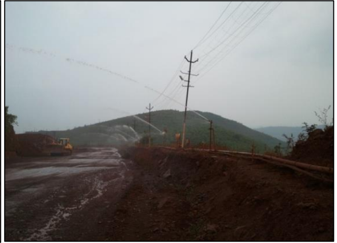
Fixed Water Sprinkler