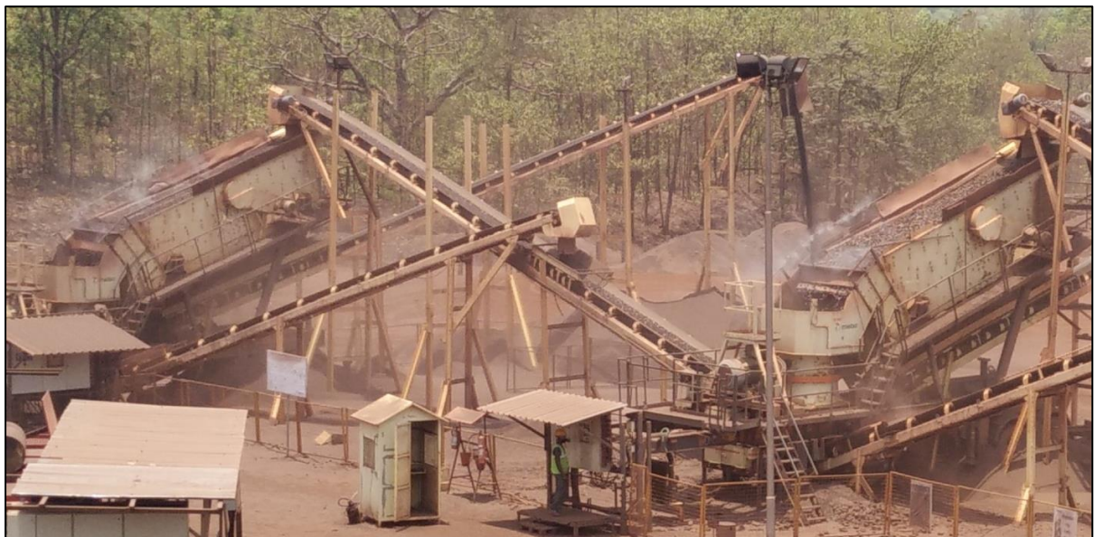
Dry Fog system in crushing and screening plant