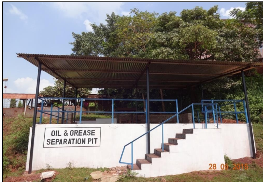
Oil & Grease Separation Pit